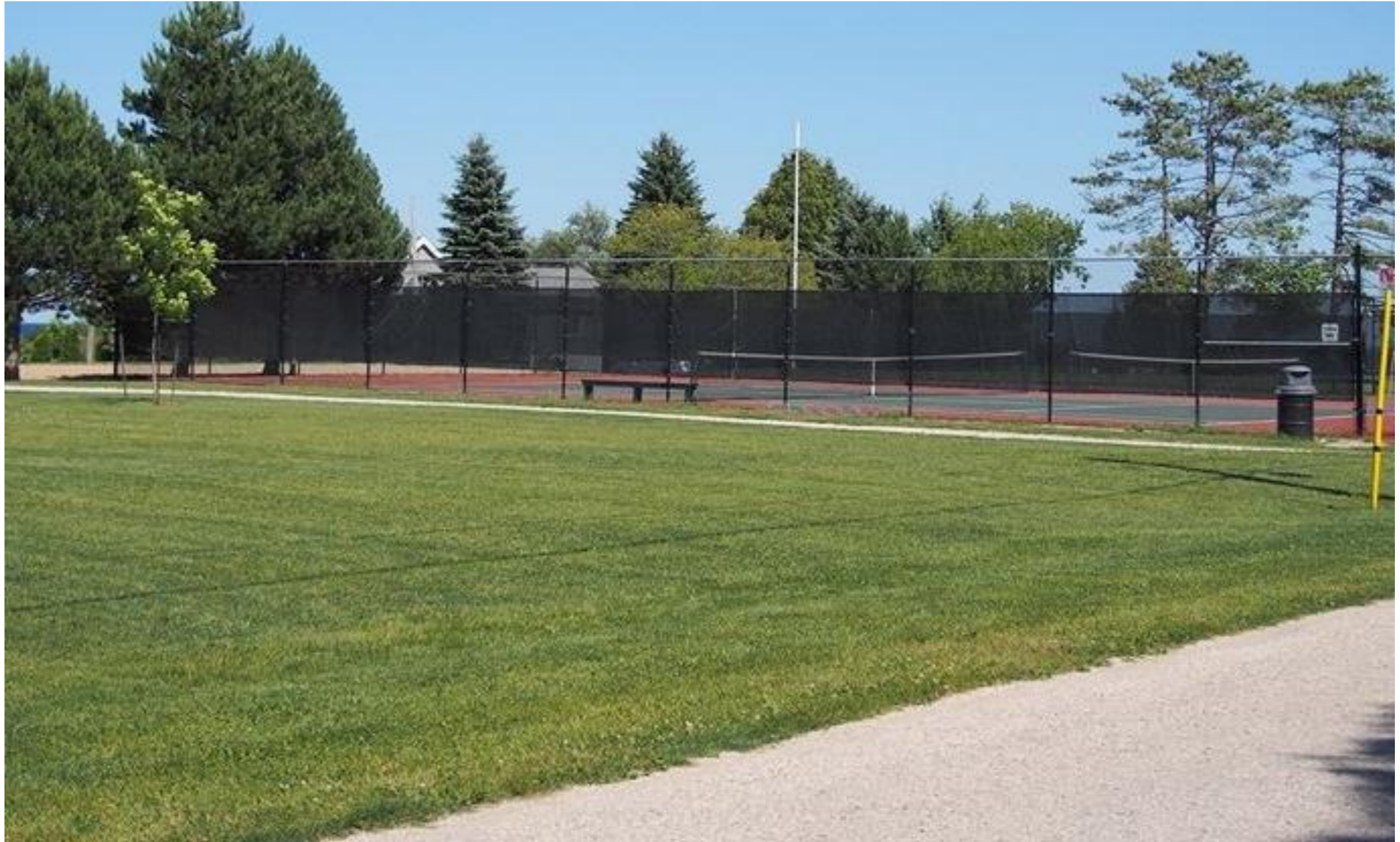
Bayview Park Tennis Courts